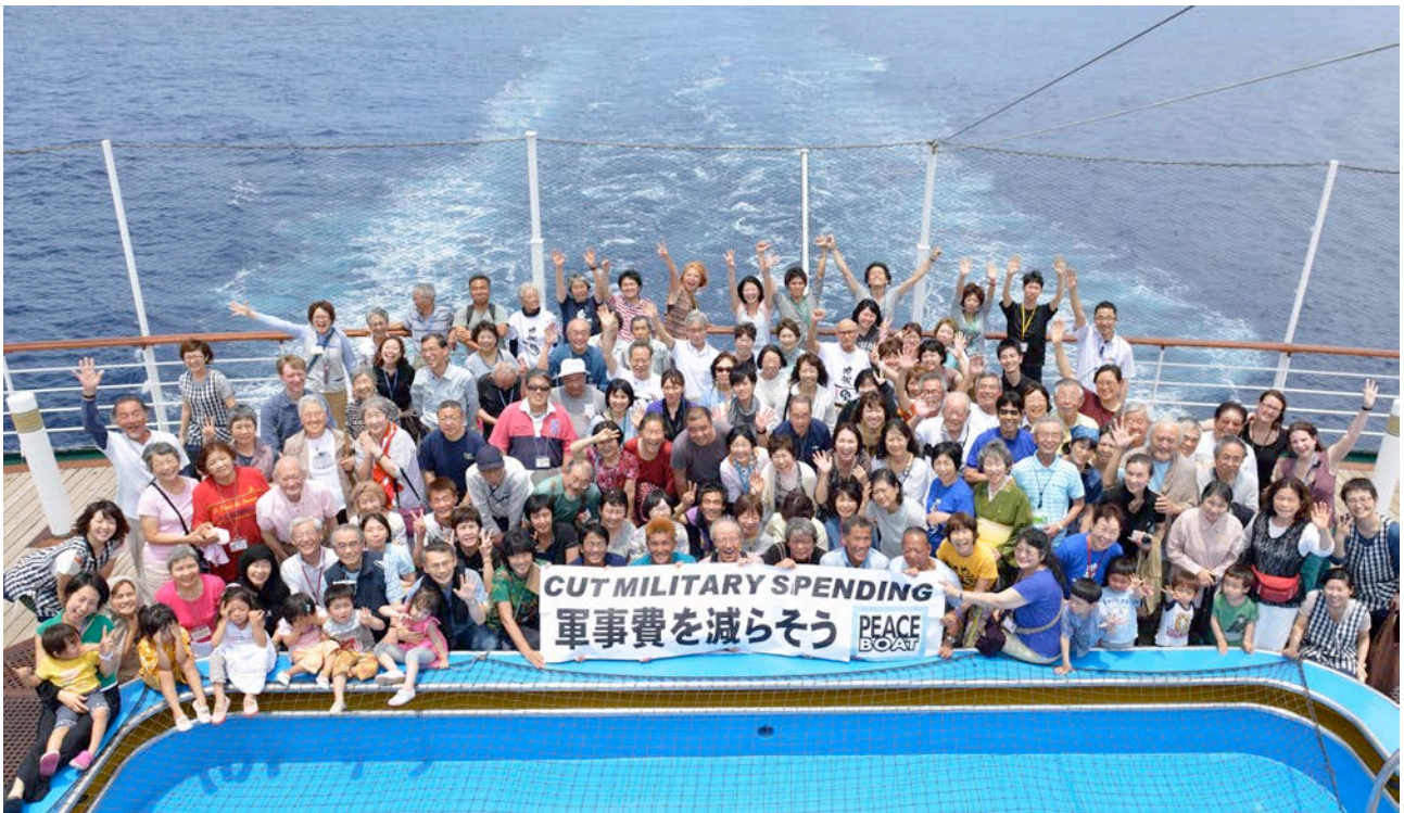
Peace Boat participants call for a cut in military spending from the Indian Ocean

After learning about the day, participants were invited to show their solidarity with the movement by taking a photograph on top deck. The participants gathered on the deck under the hot midday sun with a banner that said “Cut Military Spending” in English and Japanese. On this day, actions were taken and people held up banners and made speeches all over the world, but perhaps Peace Boat is the only place where people are calling for a cut in military spending from the oceans. Peace Boat participants of all ages participated in the photograph, including the children of the onboard Montessori Education Programme. One of the mothers of the programme, who has two children aged 3 and 1, said that it was important for her children to be in the photograph because this was an issue which affected the next generation as well, “Resources are limited, we need to think about we use those resources whether it is money or our natural resources. We need better resources in our schools, pens, books, educational materials. I want our limited resources to be used to make a better world for my children. I don't want them to grow up in a world full of weapons.”.