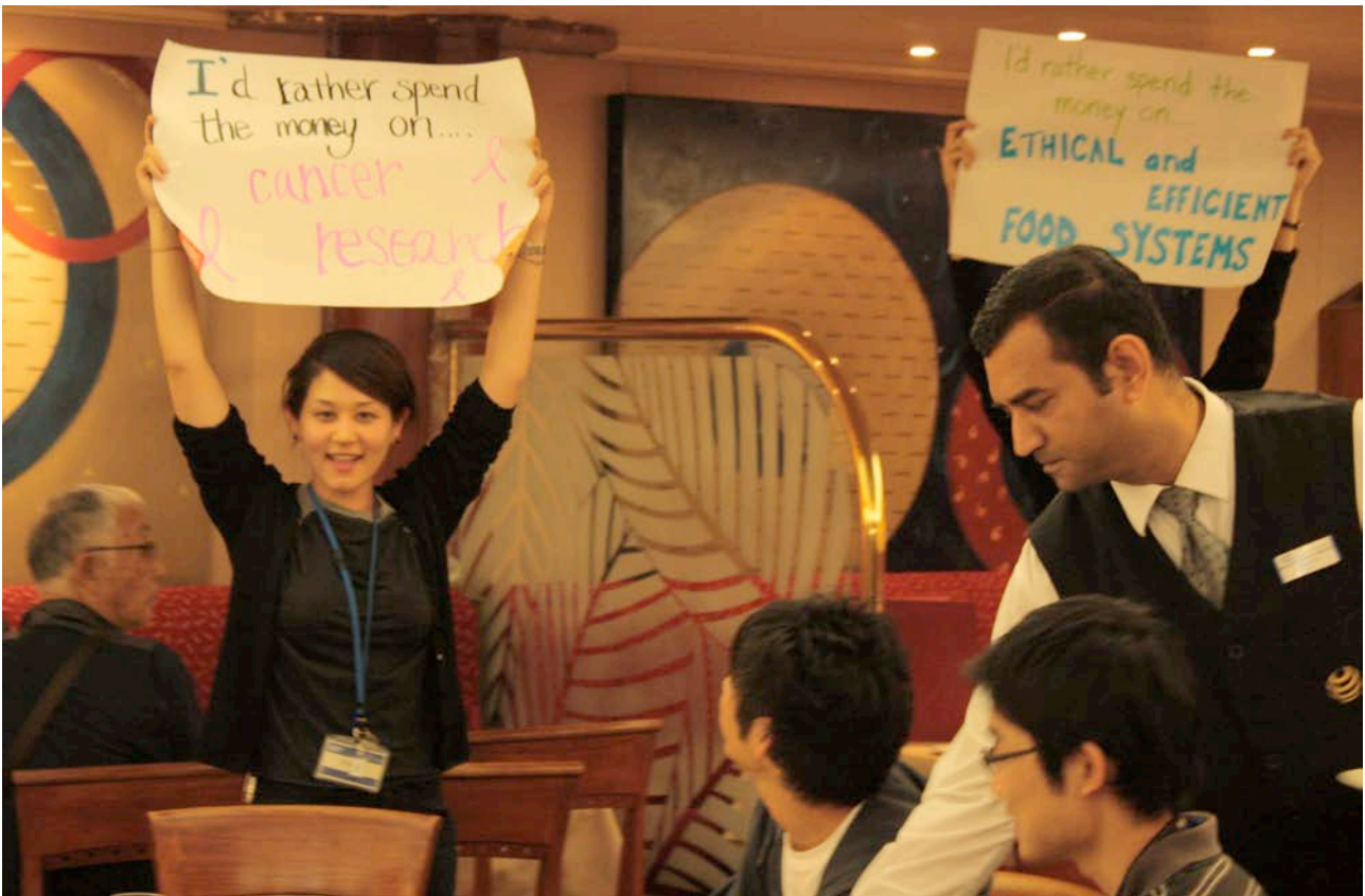
Participants surprise diners in the restaurant with a flashmob with signs of how they would rather spend the money spent on the military.

One participant, said she wanted this issue to be more widely publicised, that it should be covered in the main stream media 'we had no idea' so they set about spreading the word amongst the onboard community. One group of participants organised a silent flashmob in the dining room during dinner. They sat at different places throughout the restaurant and at exactly the same time, stood up from their seats and held posters above their heads. They had each written "I would rather spend the money on..." and then written their own choice. Several of the posters read 'education' while others were as diverse as 'cycle paths' or 'cancer research'. The posters attracted attention from those who were eating their dinner and provoked discussion later amongst those who had attended the lecture earlier in the day.